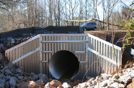
Use Pipe Wingwall