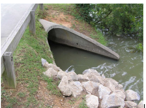
Use Pipe Flared End Section when specified in the